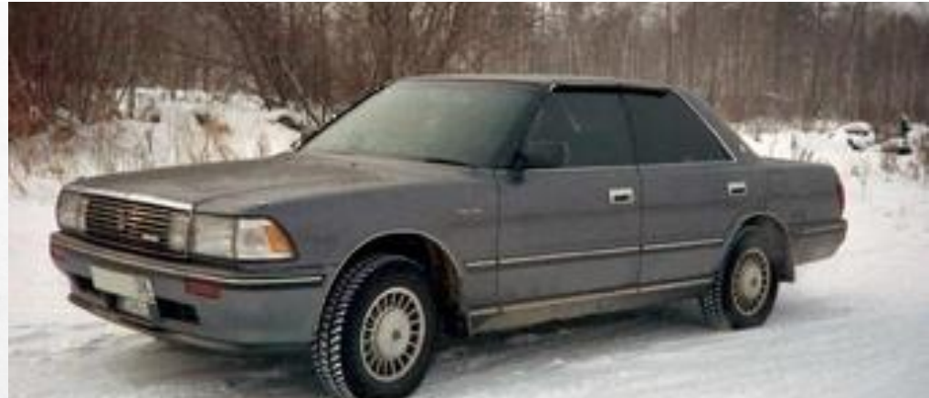
1988 Toyota Crown

The Crown might be a 1988 model, which makes it close to a Lexus LS 400, but not quite.