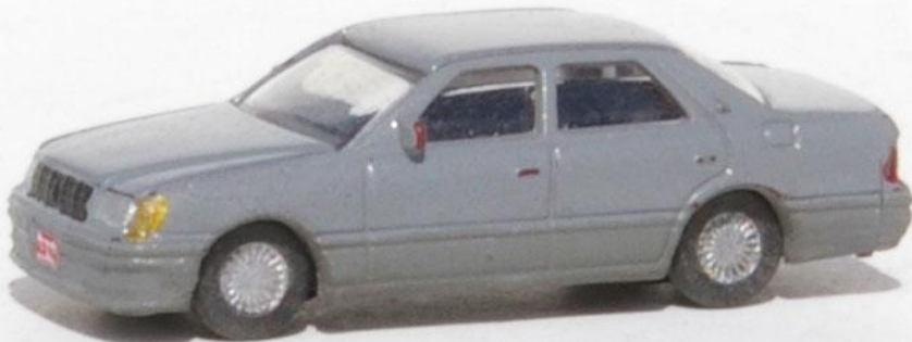
Kato Toyota Crown

Detailing includes silver paint for headlights and wheel covers, black paint for grills. The Lexus RX 300 and the Previa have painted bumpers and rocker panels. The Crown was repainted. Tires and wheels dusted with powdered Temptra for the dirty look. Not shown is red paint for taillights.